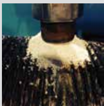
Cladded Stainless Steel Surface