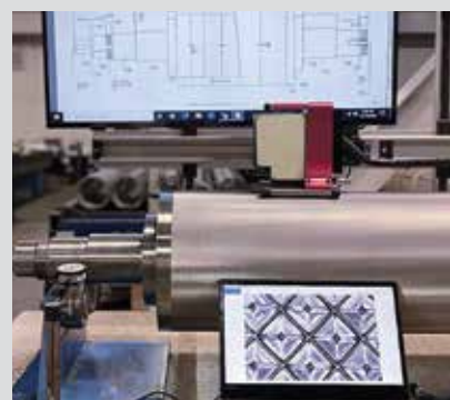
Quality Control Process